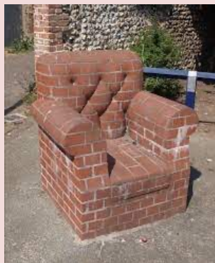
A chair made out of bricks! Is this suitable or unsuitable?

Please could you help your child to identify objects at home that can bend, stretch, be squashed or are waterproof?